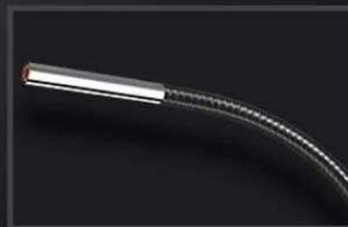
Flexible Gooseneck Easy to keep straight