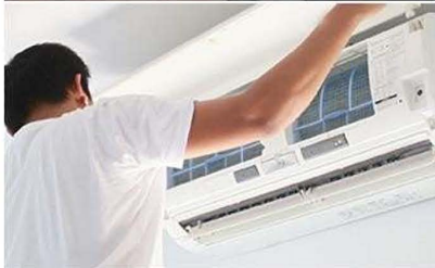
Home Appliance Repair