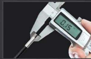
0.15inch Ultra-Slim Designed for precision inspection