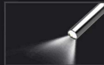
6 LED Light