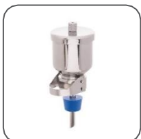
Rubber Stopper Filter Holder