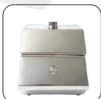
Micro Vacc - C2 For Rubber Stopper Filter Holder