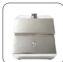
Micro Vacc - C4 For Vacuum Pump