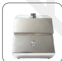
Micro Vacc - C1 For Mirco Filt Disposable Funnel